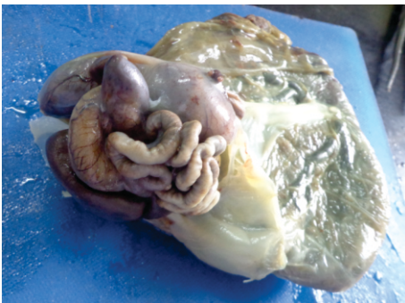
Fig. 3: Ruptured Cyst Showing Abdominal Organs

drained scanty serous fluid and retrieved abdominal organs were seen. Abdominal organs included mal developed small intestine and colon. Well developed liver, spleen, pancreas and heart were there in the cyst.